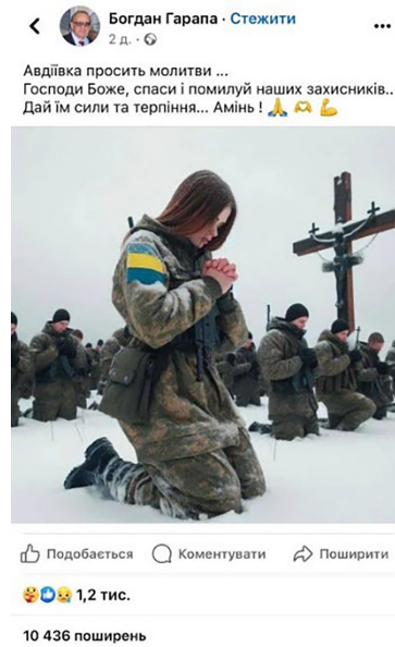
Figure 4. Second sample of disinformation material

Particularly dangerous are materials created using AI that appear sufficiently convincing for uncritical perception but contain characteristic signs of artificial generation (anatomical anomalies, perspective distortions) (Fig. 4).