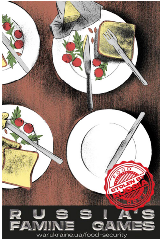
Figure 1. First sample of counter-propaganda material