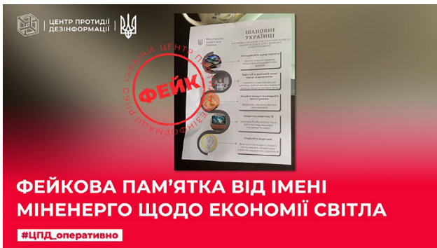
Figure 2. Second sample of counter-propaganda material